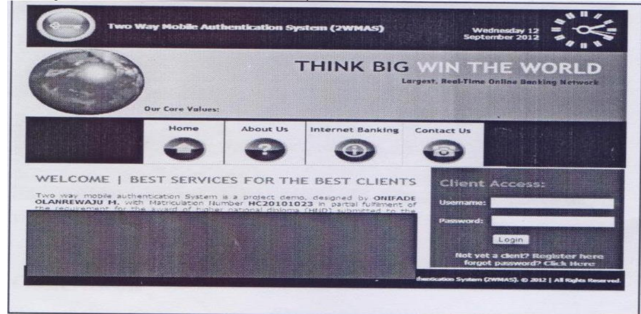
Fig. 2: Screen shot of Main Page

The first screen is the main page or home page, which points to all other pages on the system. The next page is the input screen for the new user. Others are Transfer processing screen, client information screen and so on. Figures 2 and 3 show the screen shots from the system: